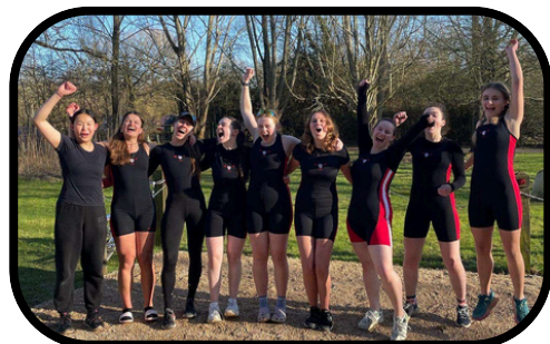
Somerville W1 Blades Winners 2025