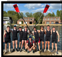
Men's City Bumps crew