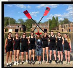
Women's blades-winning City Bumps crew

A truly fantastic day and a highly promising taste of what's to come for SCBC in Summer Vllls 2025!