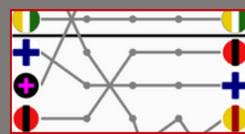
M1 Torpids 2025 bumps chart