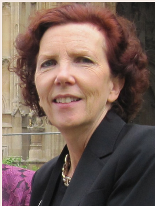
Jan Royall Principal