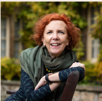
Jan Royall Principal