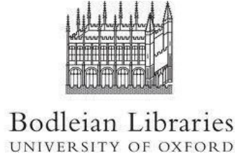
Figure 1: Bodleian logo

libraries that exist - most of which look utterly gorgeous, and all of which are worth investigating. In addition to being an invaluable source of books, they also provide a quiet environment in which to work.