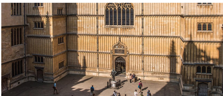
Bodleian Old Library https://www.bodleian.ox.ac.uk/libraries/old-library

And then there is, of course, the most famous Oxford library of them all, the Bodleian Library. As a copyright library it contains most books and e-books published in the UK. You usually won't be able to borrow from the main Bodleian (you can from your subject or college libraries) and most books are not on the open shelves. But using this library is an experience in itself, and you can find out more about how to do so here: