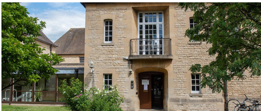
Music Faculty Library https://www.bodleian.ox.ac.uk/libraries/music

Subject libraries are also sometimes referred to as department or faculty libraries, and are the libraries associated with a specific discipline, for example the Radcliffe Science Library (RSL) for the physical and life sciences, or the Social Science Library for PPE. All of them come under the umbrella term of 'Bodleian libraries', so you may see them referred to as, for example, the Bodleian Social Science Library, but they are not the Bodleian