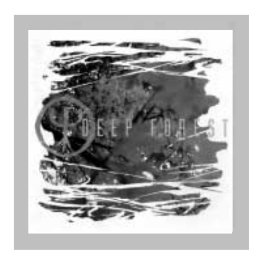
Figure 3 The "maybe . . . your future" of primitive and spiritual modernism

The second reference here is to Simha Arom, another CNRS ethnomusicologist, whose recordings of Central African pygmy music are sampled on many of Deep Forest 's tracks. In fact much of the music on Deep Forest involves pygmy references, and the theme of the African rain forest and its peoples is announced strongly in the CD's music and packaging. Indeed, the introductory song, also titled "Deep Forest," begins with a very deep and resonant voice that announces (in English): "Somewhere deep in the jungle are living some little men and women. They are your past. Maybe they are your future."