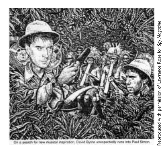
Figure 1 The curator's adventure of discovery

Into and through the 1990s, pop star curation continued to lead the marketplace expansion of world music. But in each case distinct models of the inspiration and collaboration mix also emerged, revealing more of the political and aes-