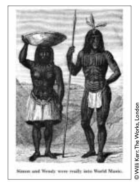
Figure 2 The underlying persistence of primitivism