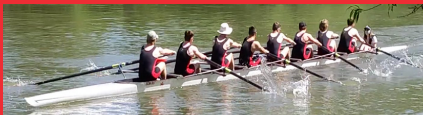
Our men's crew laying down some watts, and setting a very competitive time, at ISL B!