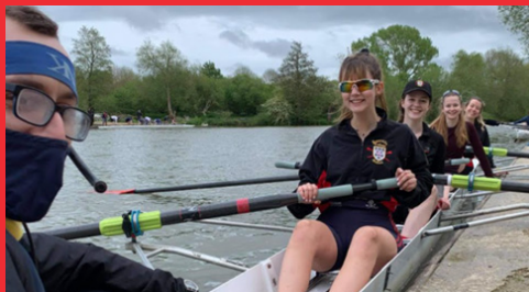
SCBC women entered a four into ISL A. Despite the race being klaxoned twice, they had a great time!