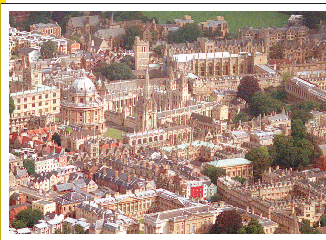
A picturesque view of Oxford