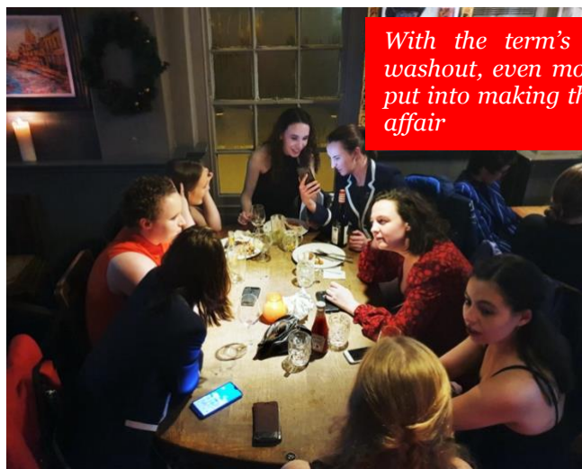
With the term's rowing having been a washout, even more effort than usual was put into making the termly dinner a joyous affair

Our termly dinner took place at the now habitual venue of the Royal Oak, much to the delight of a certain president because it serves his beloved Doom Bar, which indeed flowed faster than the Isis in full flood. As usual the other customers struggled to work out whether a platoon of foot guards or the entirety of the Red Army Choir had stumbled into the pub as we entered, beblazered and in good spirits. The customary captain's speeches emphasised the promise of better times to come next term, with the rains seeming finally to have abated.