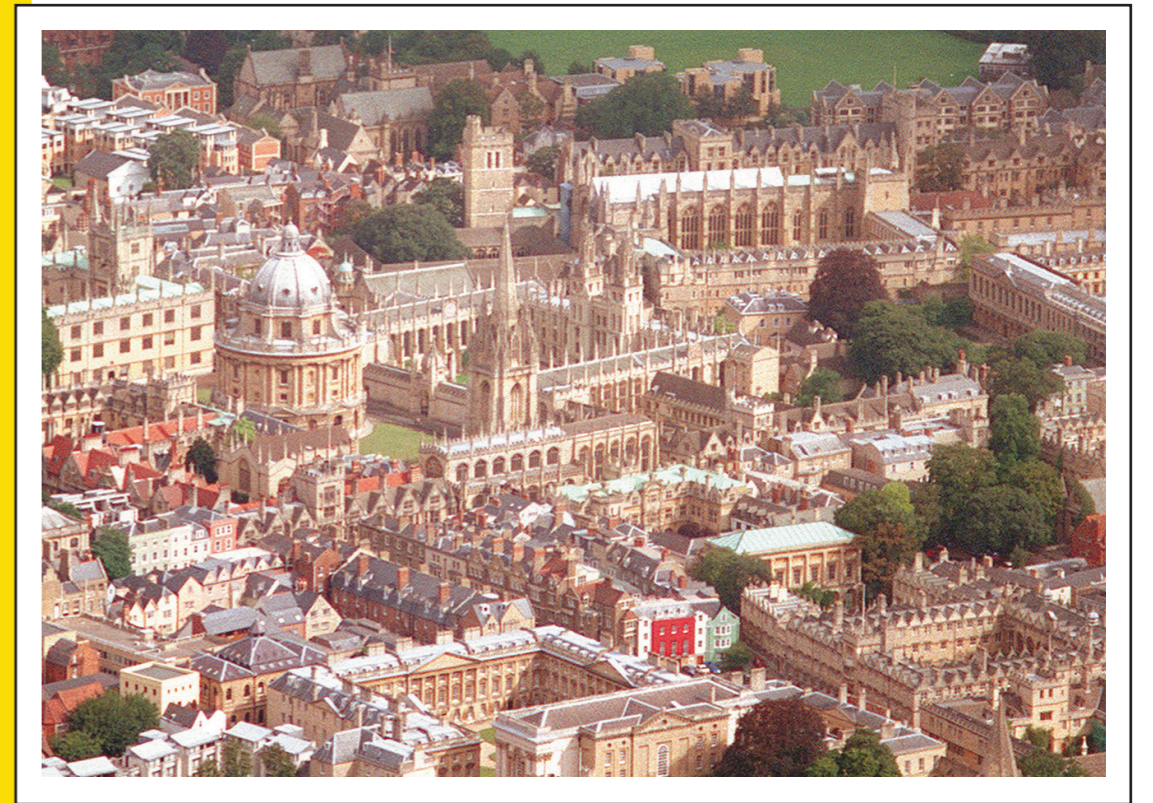
A picturesque view of Oxford