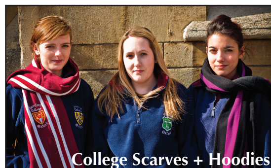
College Scarves + Hoodies