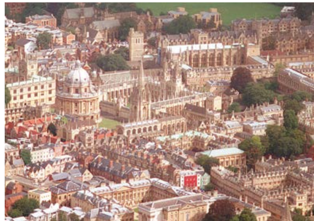
A picturesque view of Oxford