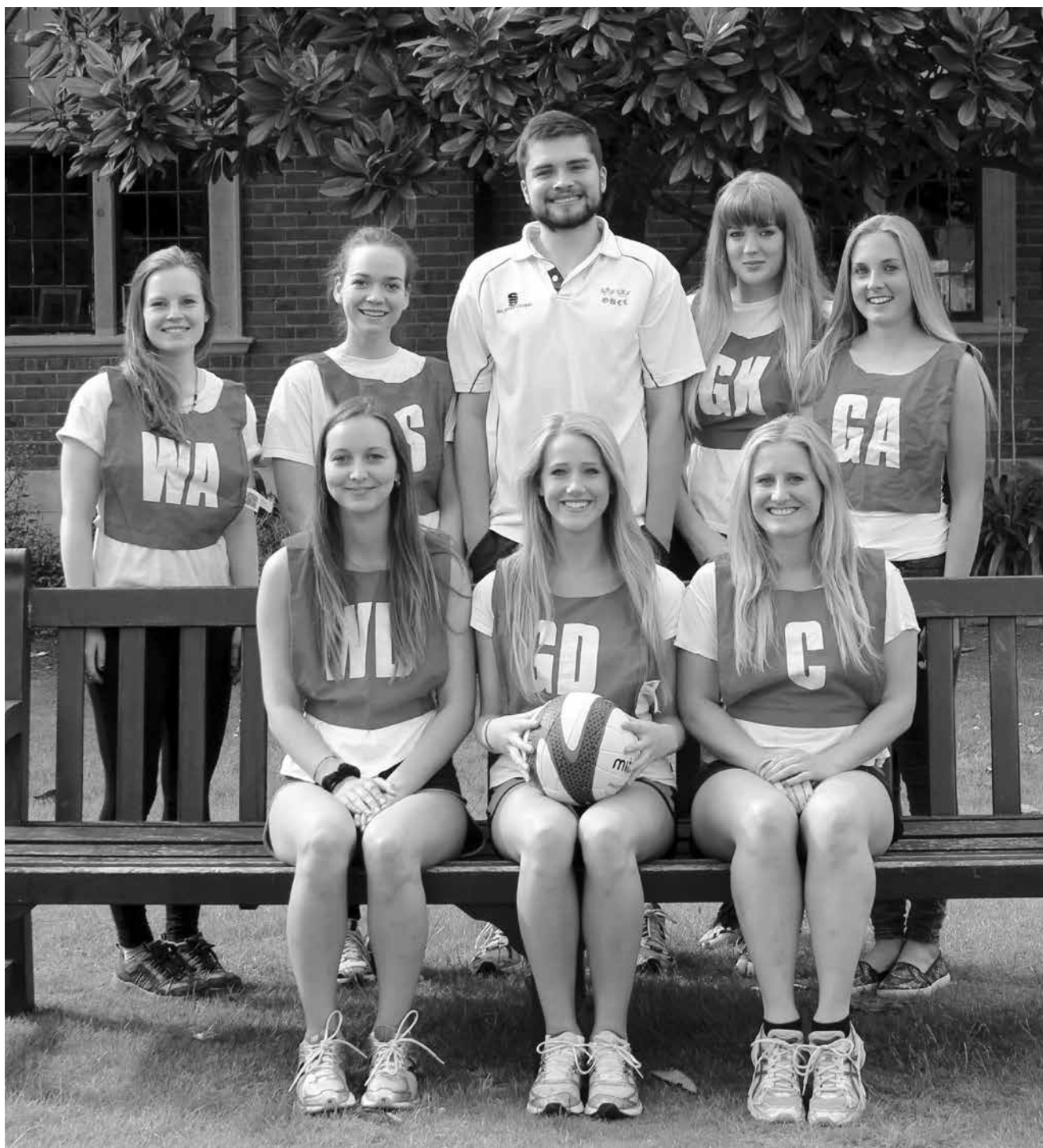
The Somerville netball team