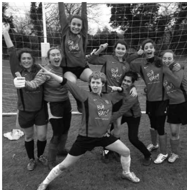
The Somerville football team

One of our pressing concerns has been the relative lack of graduate housing, and the MCR will remain committed to exploring solutions to this challenge.