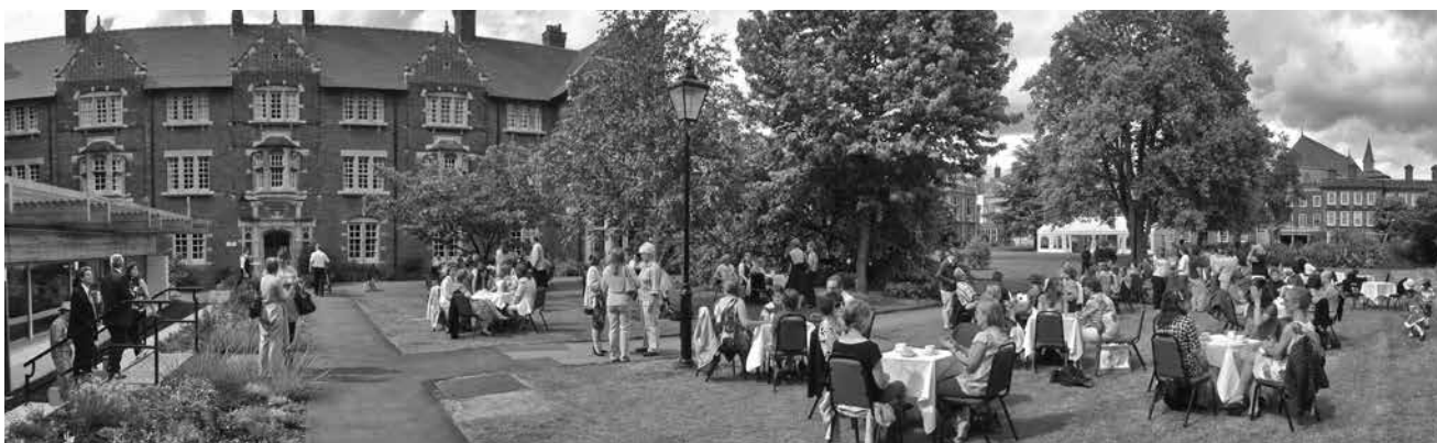
The 2014 Gaudy

Applications for grants should be made to elizabeth.cooke@some.ox.ac.uk or Lesley.brown@some.ox.ac.uk