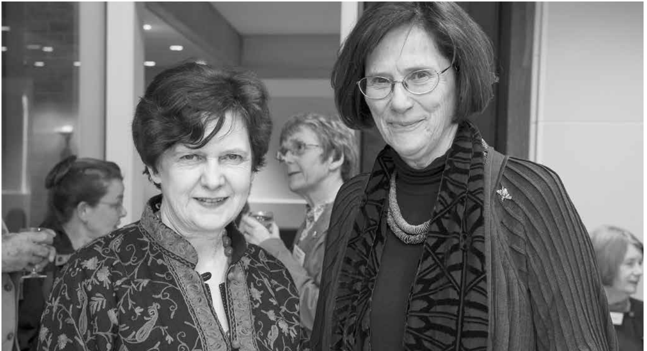
The Principal with Dame Hermione Lee, President of Wolfson College, on the event of Dame Hermione's talk on Penelope Fitzgerald, novelist and Somervillian. In 2013 Dame Hermione was awarded the James Tait Black Memorial Prize for her biography of Fitzgerald.