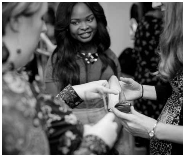
Alumni at a London Group event at Christian Louboutin, March 2014

In the past some alumni have kindly paid a voluntary contribution by standing order towards the London Group newsletter, but our events are now advertised online and incur no printing or postage costs. Please cancel your subscription if you wish, but if you decide to maintain the standing order, rest assured that the money will now go directly to the College.