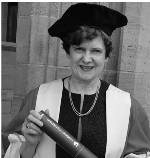
The Principal was awarded the Degree of Doctor of Laws honoris causa by the University of Aberdeen on 8 July 2014

Somerville made strides in 2013-14. The College gained a higher profile both within Oxford and further afield. Fellows achieved great academic success, with the award of prestigious research grants and major honours. We have strengthened our name for innovation and collaboration, especially in the field of global sustainable development. We have also raised significant funding for new projects which command welcome support, including generous matching funds, within the University. Through special events and affinity groups, alumni have engaged with the College in growing numbers. There has been an upturn in the proportion of candidates who make Somerville their first choice. This is the background to a strategic review which, still under discussion as this report is written, is designed to provide more support for our Fellows' research and for all of our staff, to raise the academic performance of our students and to enhance the contribution we make to the greater good, in Oxford and worldwide.