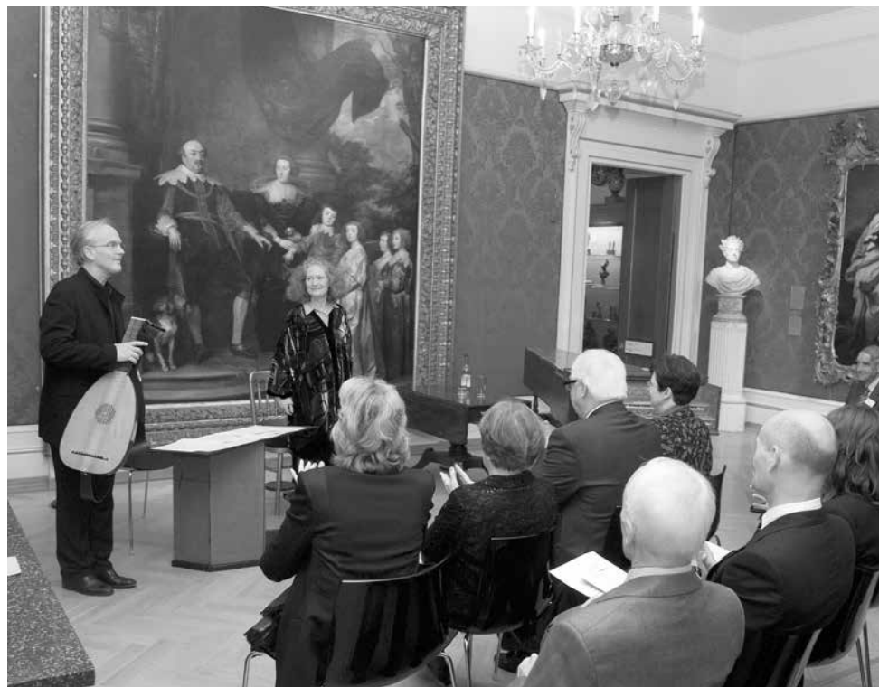
Honorary Fellow Dame Emma Kirkby (1966) sings for Somervillians at the Ashmolean Museum, October 2012

raised £156,000 for which we are enormously grateful. It was a tremendous achievement considering the many other ways alumni were supporting us at the time through the new buildings and philosophy appeals. Our dedicated student callers worked night and day to make 785 fundraising calls and we achieved a 57.45% giving rate – our highest to date. It is highly rewarding to hear the feedback from alumni after the calls. Hearing about the student experience first-hand continues to be a source of interest and we are grateful for the support that is given in return. These conversations offer an invaluable experience to our students too who often receive so much more than a donation or regular gift: they receive a historical perspective, wise counsel and career development advice from our alumni with their vast spectrum of experience, not to mention a set of skills which will serve them well for the future.