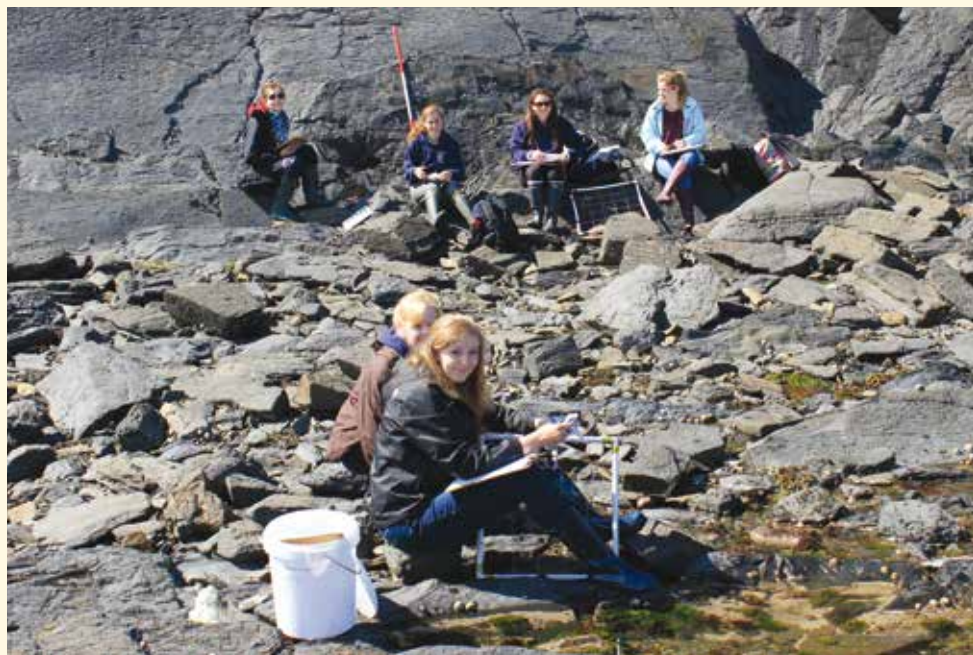
Biology students on field trip