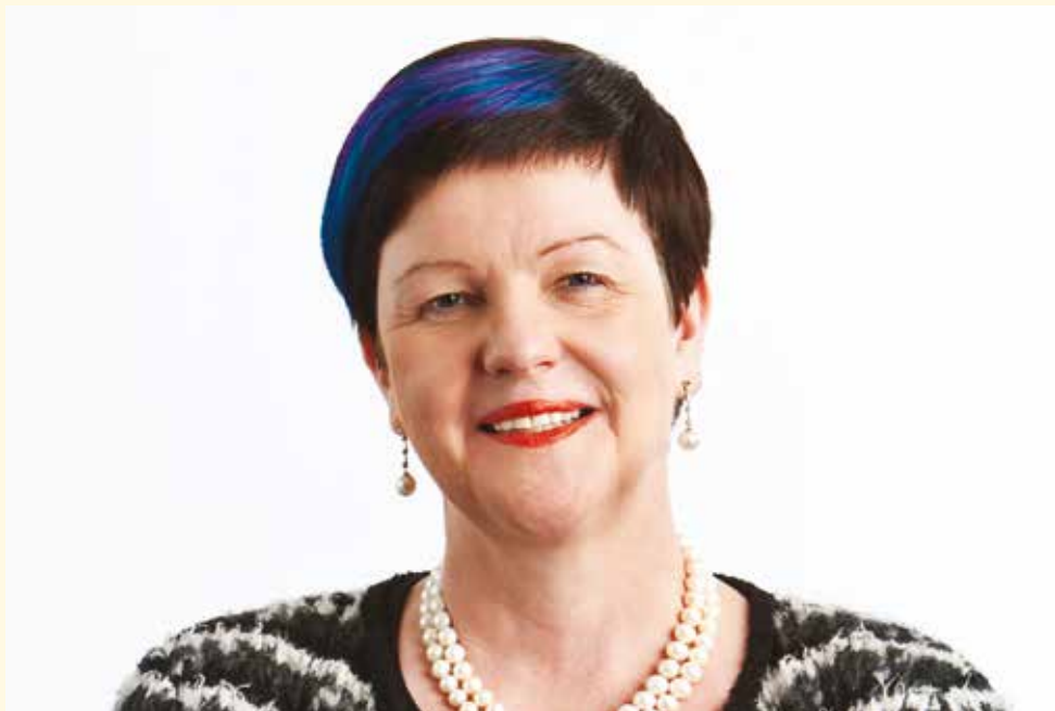
Baroness Lucy Neville-Rolfe (PPE, 1970)