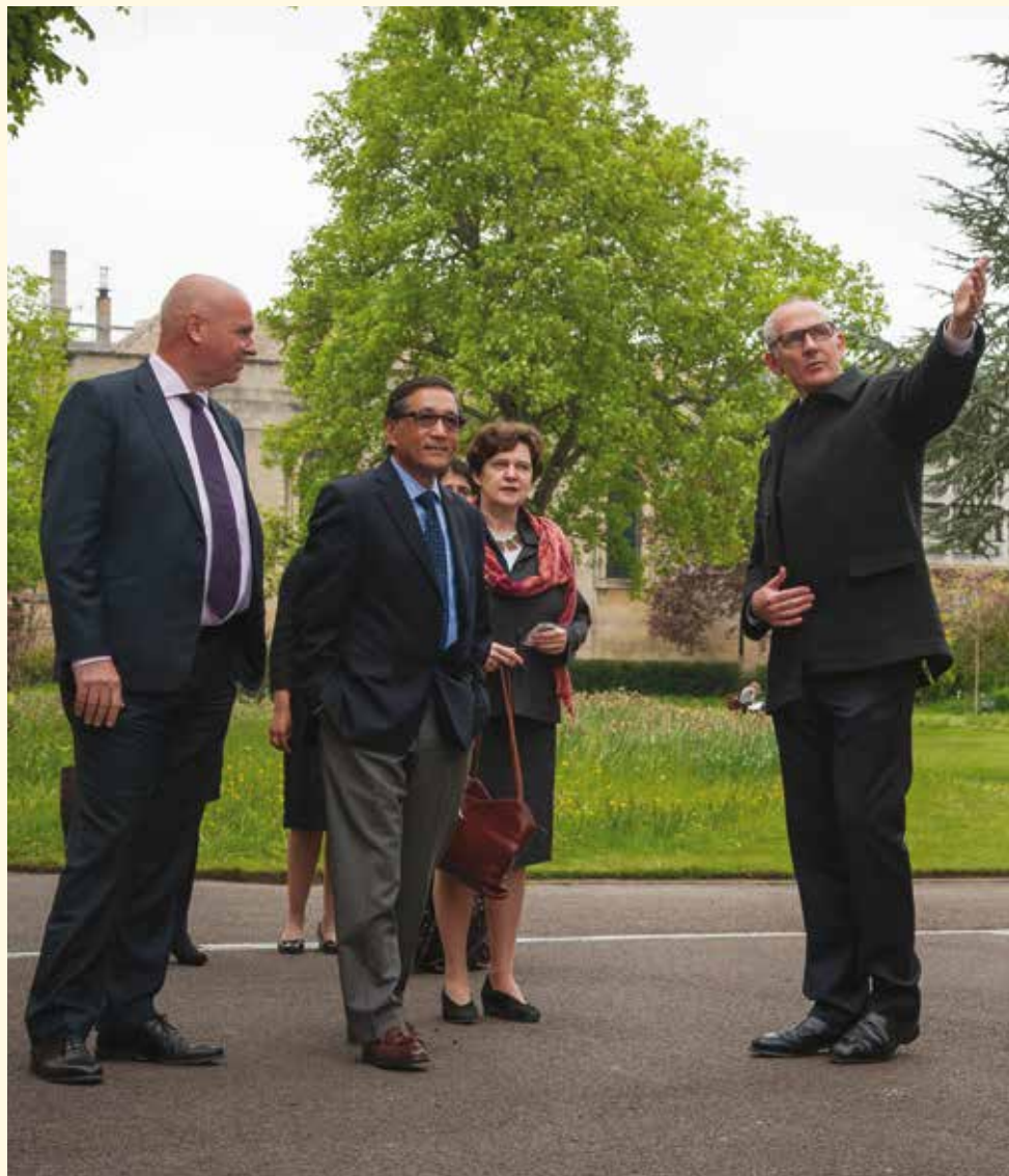
The Indian Education Secretary views the proposed site for Somerville's Indira Gandhi Centre, with the Principal, the architect (right) and the Treasurer (left)