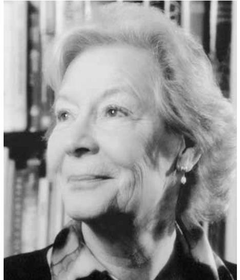
Nina Bawden (Mabey, 1943)