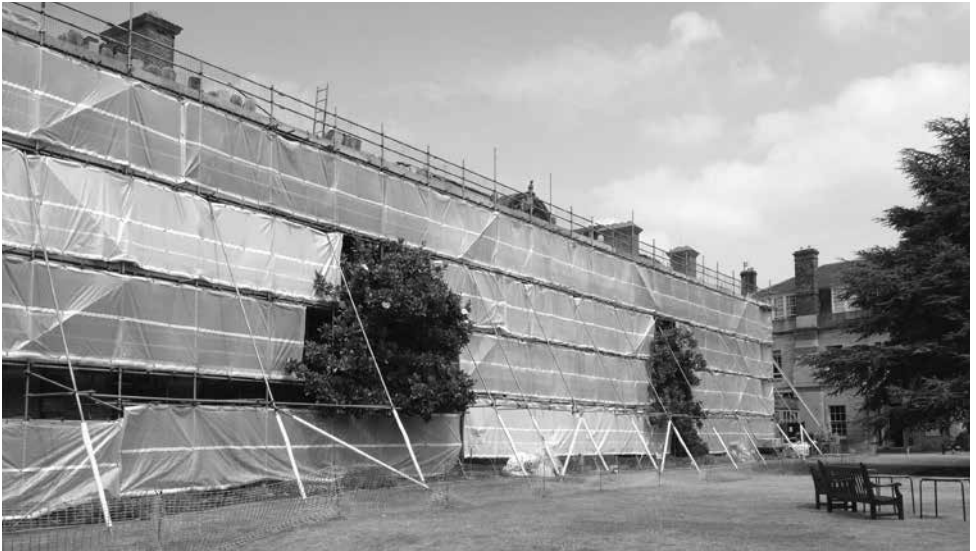
Library under plastic

Inside the library we have been making some changes too. We have finally abolished the practice of 'nesting' (the creation of piles of books/papers/stationery on desks and then leaving them there for days and sometimes weeks at a time). It was becoming increasingly untenable to allow this practice to continue with the library busier than ever following increased student numbers living in College. In order to facilitate this culture change we have brought in a number of shelves and storage spaces so that users have somewhere to keep things without blocking desk space. Everyone seems happy with the change and the library is looking a lot tidier!