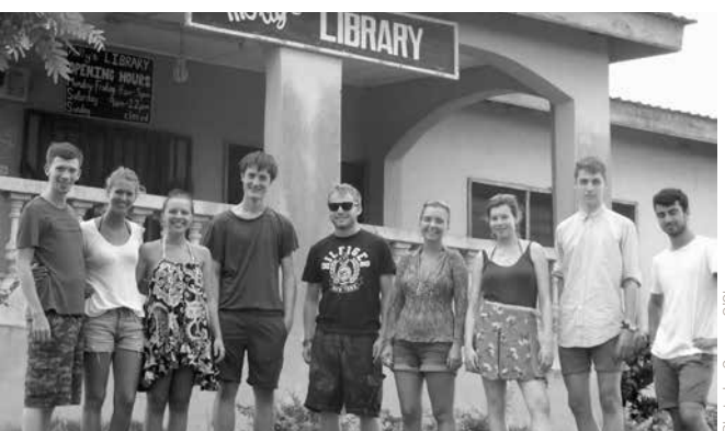
Eight undergraduates were able to visit Molly's Library in Ghana in the summer thanks to College travel grants.

Somerville's access work would not be possible without our donors' generous support of the College. Thank you for helping us make a real difference.