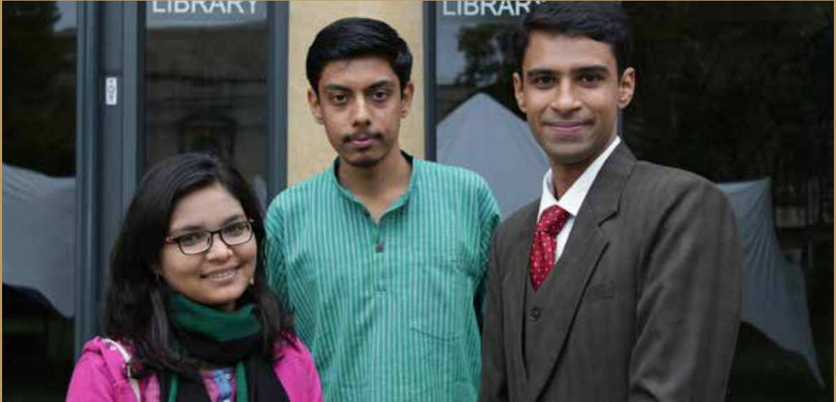
The first Indian graduate scholars to become part of the Centre