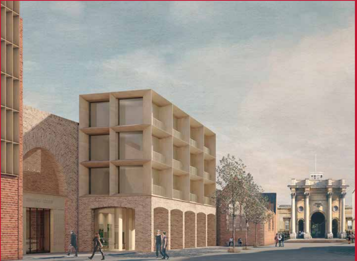
The new building on the Radcliffe Observatory Quarter site

The building will be named in accordance with the wishes of the benefactor.