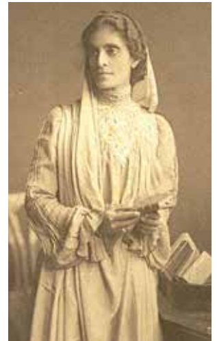
Cornelia Sorabji, the first Indian student at Somerville College, and the first Indian woman admitted to a British university