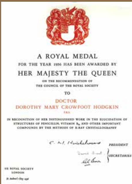
Royal Society recognition: Dorothy Hodgkin's 1956 Royal Medal certificate

Women remain under-represented in the sciences, even 50 years after her Nobel Prize. It therefore falls to the current generation to celebrate high-profile female successes in science like Dorothy Hodgkin – and to pursue policies which ensure that the next generation has far more of them to celebrate.