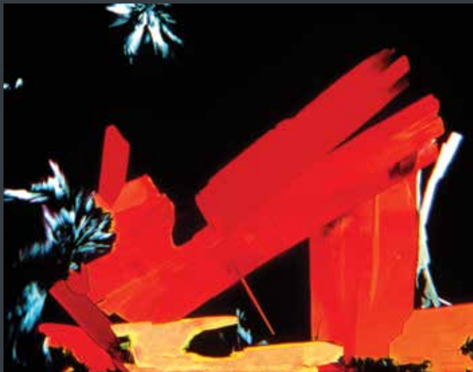
Vitamin B 12 crystals

large molecules, 60 years ago, many calculations had to be done by hand, and even 50 years ago a calculation on a molecule the size of vitamin B 12 would take several hours on the only Oxford computer (which probably had less power and memory than a smart phone).