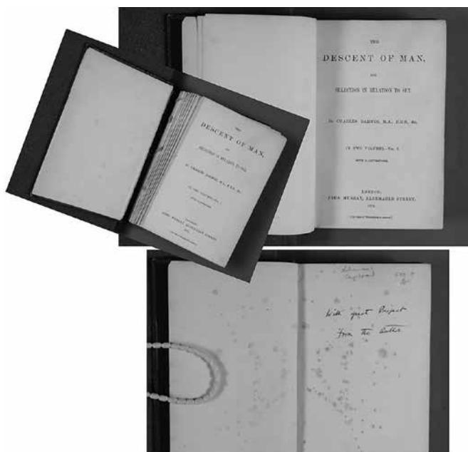
Darwin's Descent of Man