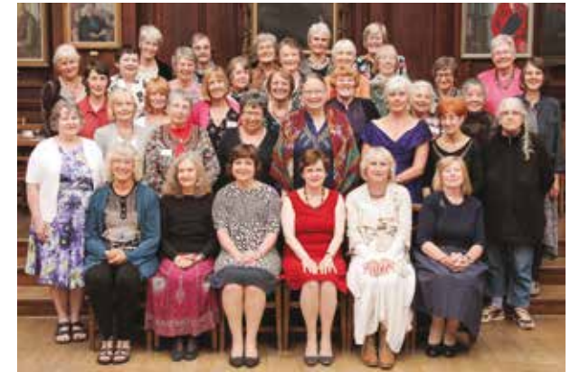
The 50th anniversary of the 1965 matric year.

Delighted as we all are, in Somerville, with the increasing level of donations and the growth in our permanent endowment, there is still so much that needs to be done. Some illustrious Somervillians past and present have acknowledged