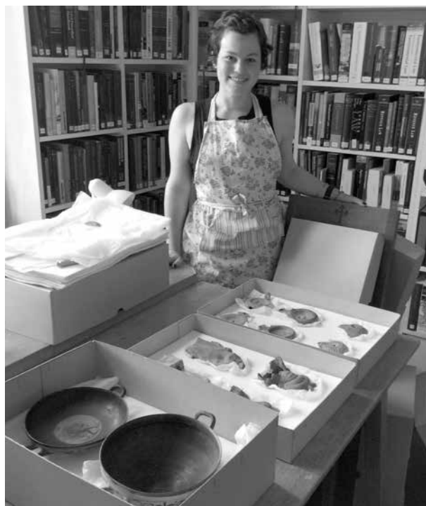
... and then boxing them up securely.