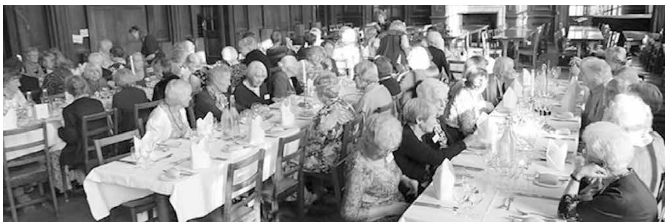
The 2016 Somerville Gaudy celebration for matriculation years pre-1964

Applications for grants should be made to elizabeth.cooke@some.ox.ac.uk or lesley.brown@some.ox.ac.uk