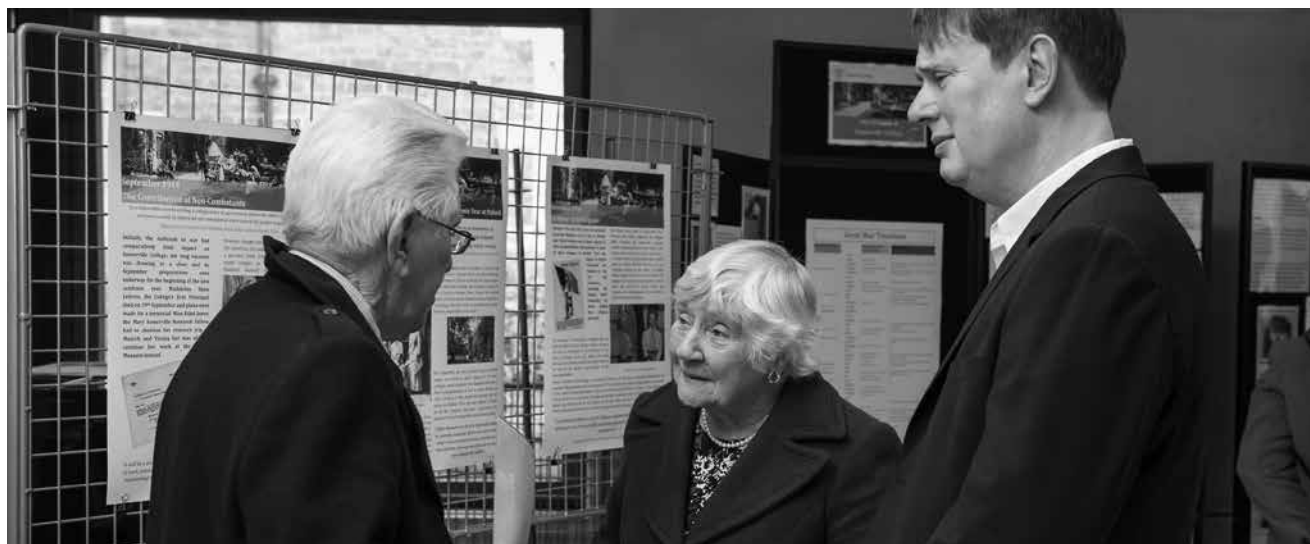
Shirley Williams and Mark Bostridge speaking with an attendee of the Great War Roadshow held by Somerville on November 15th 2014