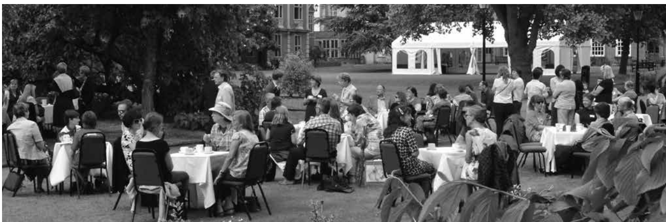
Somerville Gaudy 2014